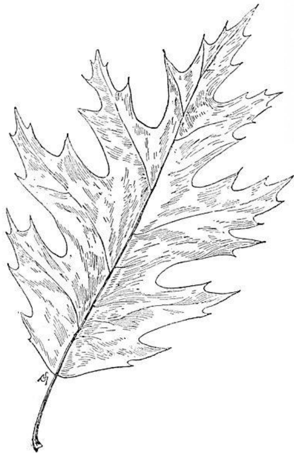
Red Oak ( Quercus rubra )